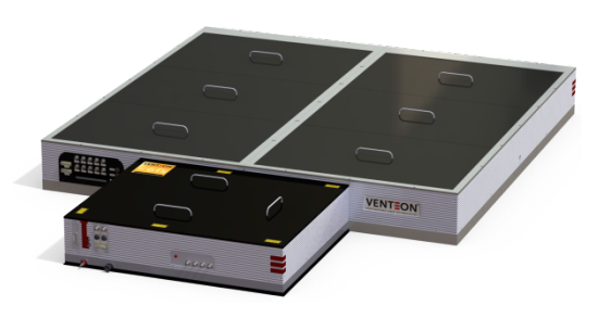
OPCPA - amplified systems